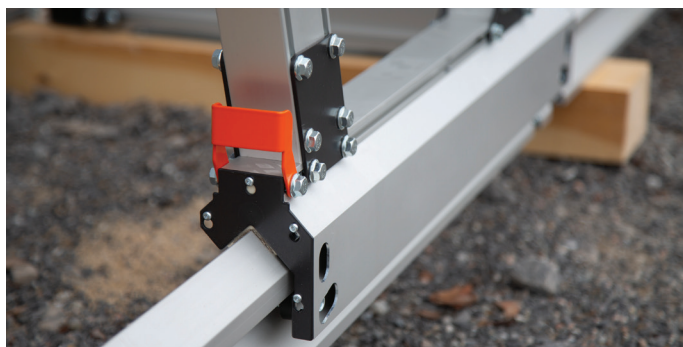
The saw carriage glides easily on the rail, completely free of play.