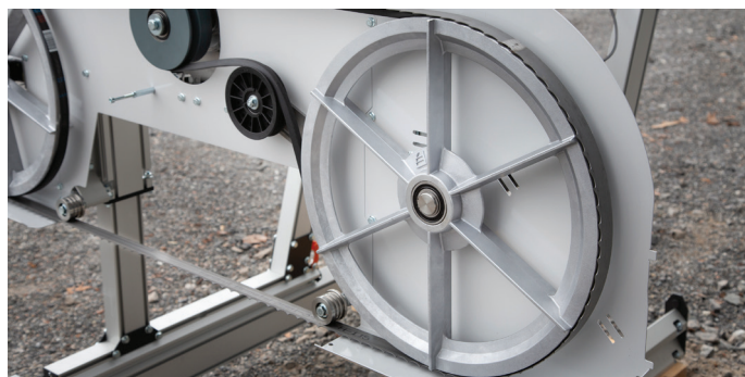
Band wheels with fan blades, cools the blade and keeps the cover clean.

The B701 is a “low-tech” sawmill—in the best sense of the word. The construction is easy to understand, intuitive to use, and built to last. With few things that can go wrong, ownership easy and hassle-free—it just works, year after year.