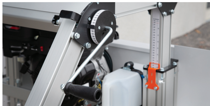
Smooth feel in the hand crank, adjustments are quick and effortless.