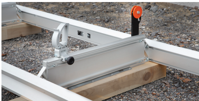
Sturdy log bed with a wide contact surface against the log.