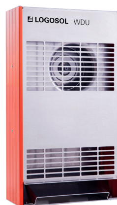
LOGOSOL WDU Wood Drying Unit

The upgraded Sauno drying unit of 2 kW has a significantly more powerful fan action for air circulation in your drying chamber. The new unit also has an integrated air intake that draws air into the dryer by means of the underpressure formed in the air stream. The dry and cold outside air is mixed with the heated, moist air in the Sauno drying unit before reaching the wood in the chamber. This means that you will have a more uniform and controlled drying result. Together with the top valve of the drying chamber, with its graduated opening positions, you control how quickly the steam is let out.