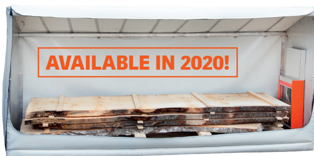
LOGOSOL WDU Wood Drying Unit incl. Drying Chamber

Logosol's drying chamber is a smart solution with a soft, insulated cover that is supported by an internal, rigid aluminium structure. The drying chamber retains the hot and moist air during the initial drying phase. If the drying chamber is installed outdoors, which we recommend, you use a two-layer solution, with a protective outer tent. The drying chamber together with the drying unit only weighs about 50 kg, so two people can easily move it.