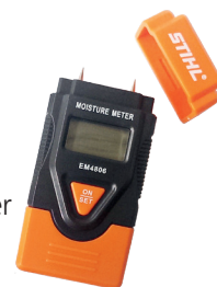
Moisture meter, Stihl SKU: 0464-802-0010

Logosol sells a common type of moisture meter that measures the electrical resistance between two metal pins pressed into the wood. This type of meter gives a direct reading. The measurement is not exactly accurate but gives a good indication. The moisture meter can also be used on cement and plaster.