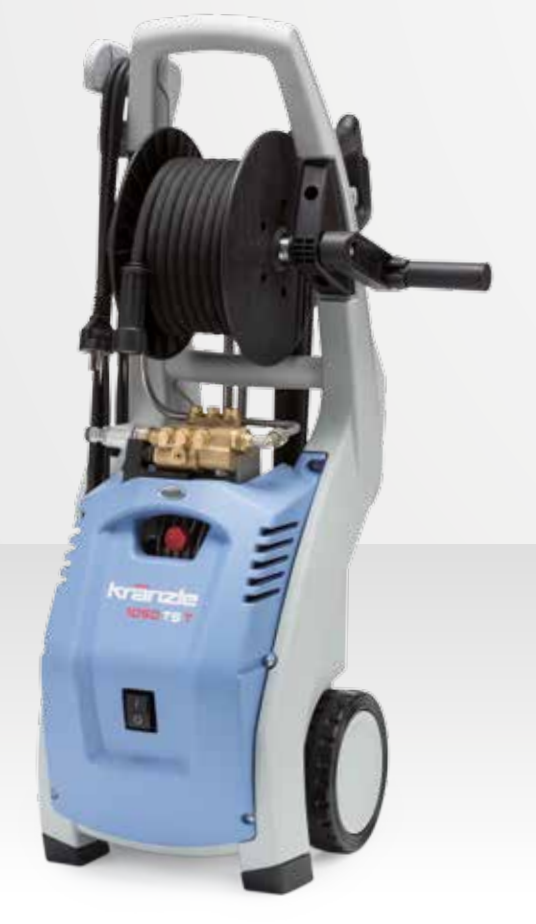
K 1050 TS T (with hose drum)