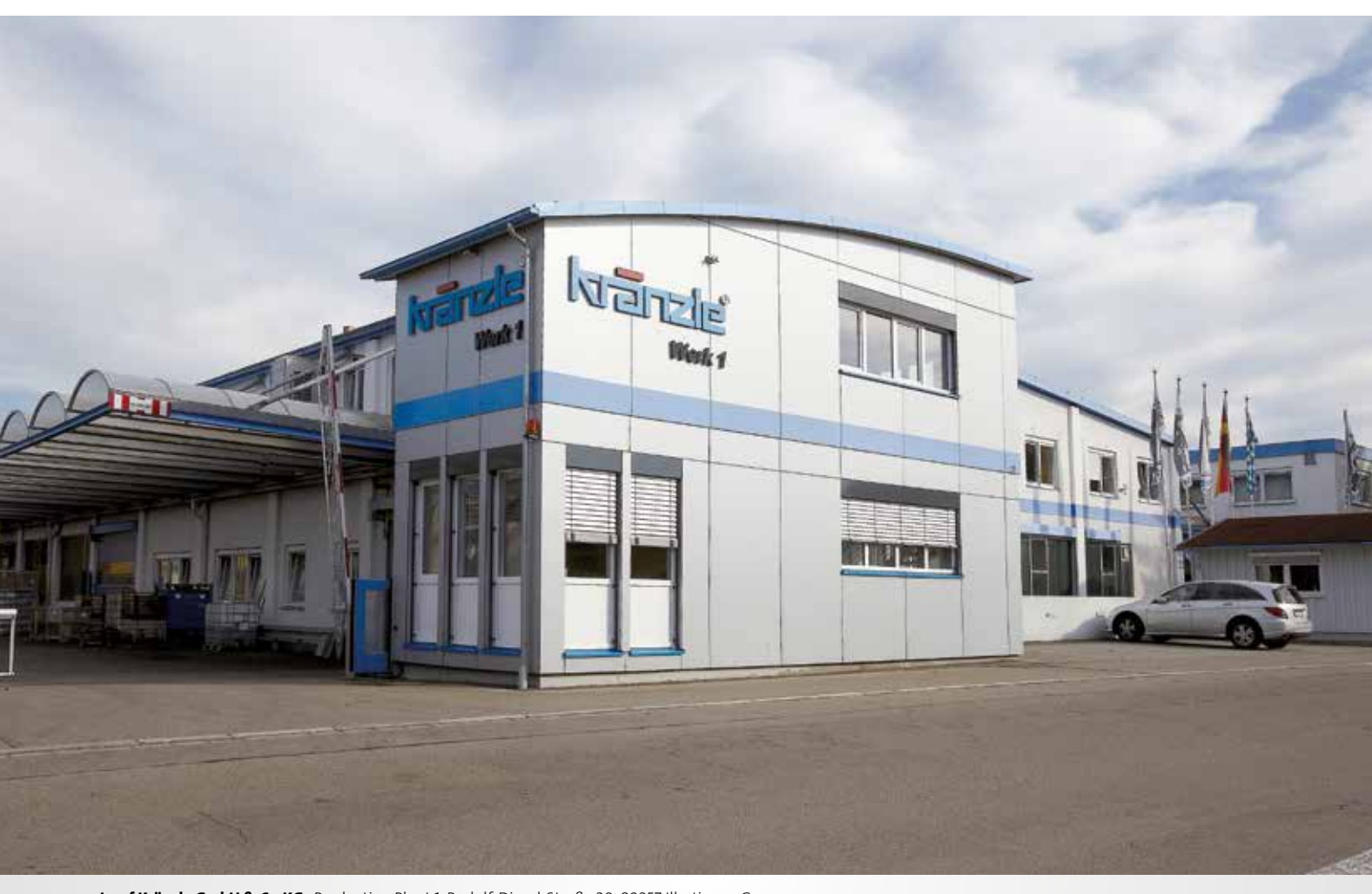
Josef Kränzle GmbH & Co.KG, Production Plant 1, Rudolf-Diesel-Straße 20, 89257 Illertissen, Germany