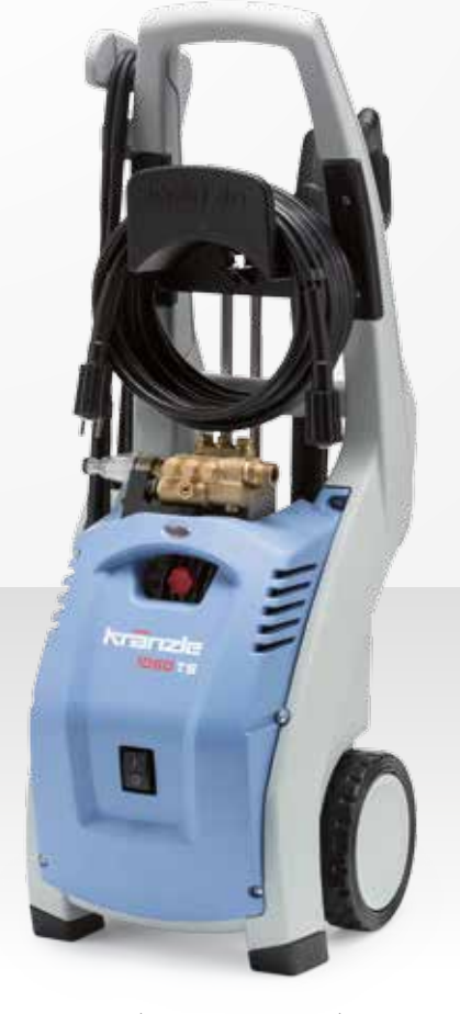
K 1050 TS (without hose drum)