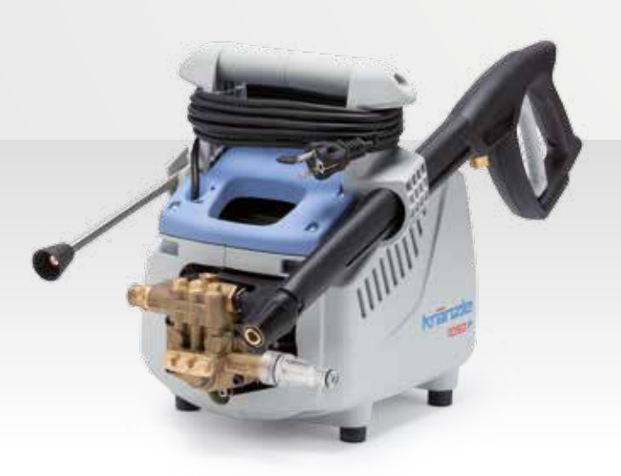
K 1050 P (portable)