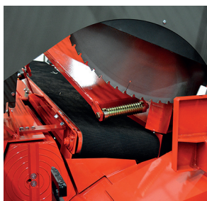
Ø1000 mm hard metal blade.