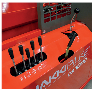
Full hydraulic and easy control.

Full hydraulic steering, perfect control of the wood while cutting and splitting, and the hydraulic-driven slewing output conveyor ensures the efficient usage of Hakki Pilke CS 1000.