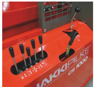
Full hydraulic and easy control.

Full hydraulic controls , perfect control of the wood while cutting and splitting, and the hydraulic-driven slewing output conveyor ensures the efficient usage of Hakki Pilke CS1000.