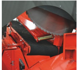
Ø1000 mm hard metal blade.