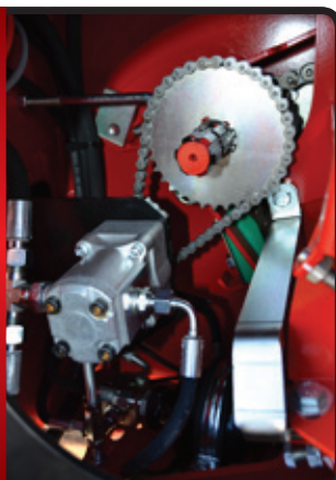
Hydraulic unit driven by PTO with unwinding device