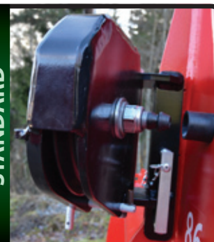
A strong lower pulley can be quick-locked for transportation