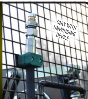
The Breather of Hydraulic System is attached high to the safety screen to avoid oil to leak to the winch mechanism.