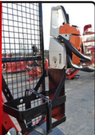
Handy holder for chainsaw and jerry can