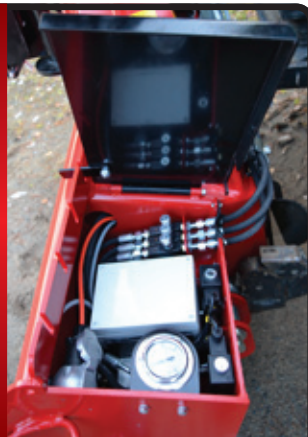
The hydraulic system for unwinding device is located safe in the covered tool box. Easy to service.

FARMI, a pioneer in winch construction, has now enlarged its series of three-point mounted winches for demanding circumstances by a new model called FARMI JL86. The development of this new professional winch model is based on over 50 years of experience in winch construction. FARMI JL86 solid construction guarantees a long working life and comfortable operation. High drum storage capacity, uniform winding, light-weight, compact design, reliable function and close attachment are the main features of FARMI skidding winches. The FARMI JL86 winch is a safe and high-performance tool that can be used practically in most forest applications. Available are three different versions: a rope controlled model, a hydraulic controlled model and also a model equipped with unwinding device and remote control for fully professional operations.