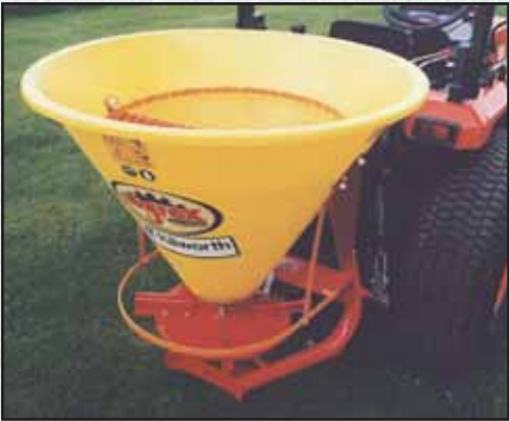
● XL 250 standard