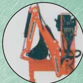
● Compact Dimensions