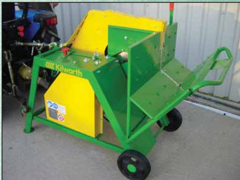
● Grizzly 700R