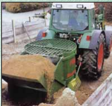
● FA Model