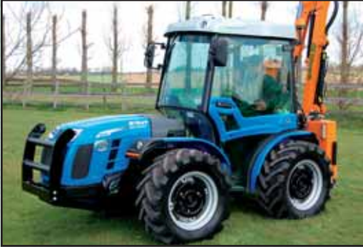
● Price List 2 : BCS Tractors

The following price lists are also available on request from Kilworth