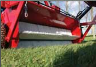
● Nylon brush with 4 replaceable sections