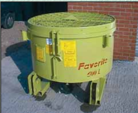
● Price List 4 : Fliegl Concrete Mixers