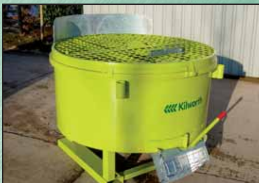
● 800 Favorite