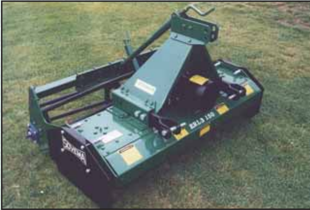
● ERL3 150