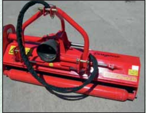
● Dragone L with front mount and hydraulic side shift option