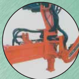
● Side Shift 19 and 23