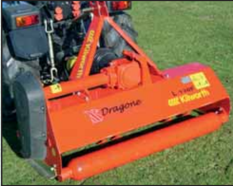
● Dragone L