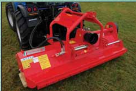
● MTL 180 Reversible