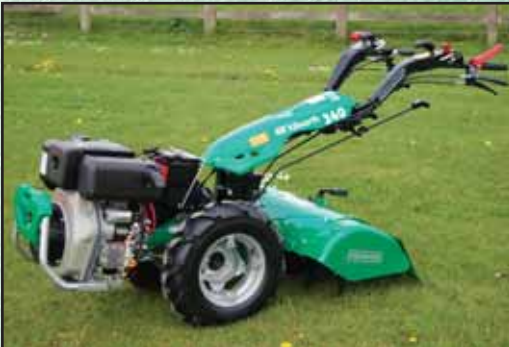
● Price List 3 : Ferrari two wheeled tractors