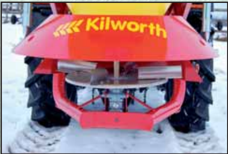
● Optional stainless steel spreading disc