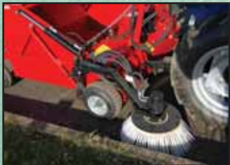
● Optional Gulley Brush