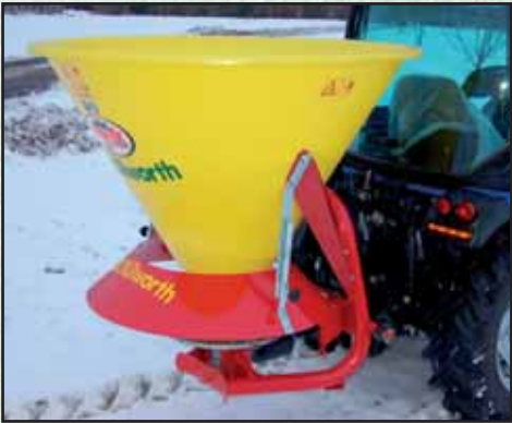
● XL 400 with salt/sand kit