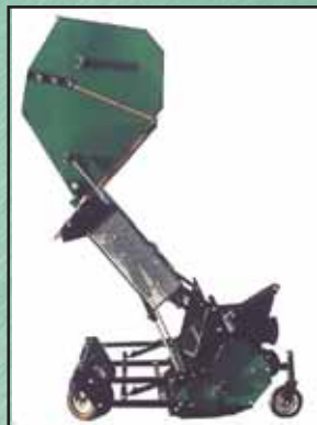
● TRIS - H : High Tip