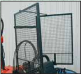
● Fitting/Guard Kit