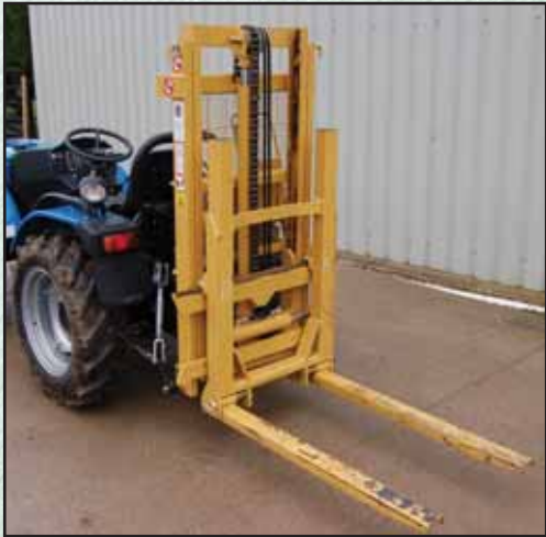
● CM9 DCL