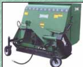
● TRIS - L : Low Tip